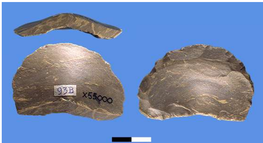
Holdaway & Stern 2004

Gould, R.A. 1991. Arid-land foraging as seen from Australia: Adaptive models and behavioural realities. Oceania 62:12-33.